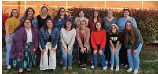
Andante a Cappella

Andante is a student-led and organized treble a cappella group formed in 2022 as a complimentary group to the Cecilians treble choir. The 15 auditioned members of Andante keep a diverse repertoire of classic choral music combined with contemporary pop and everything in between.