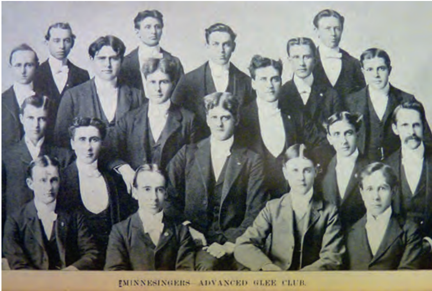
MINNESINGERS - ADVANCED GLEE CLUB.