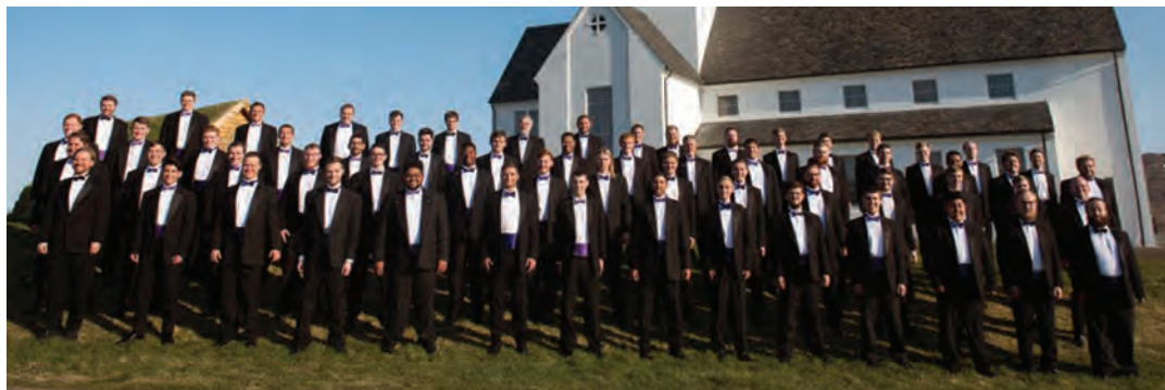
> The Glee Club in Iceland, 2016 — The Glee Club performed at the historic Church at Skálholt.

The Glee Club has traveled overseas every other year since 1980. During past tours, concerts were performed in Austria, the Czech Republic, England, Germany, Greece, Holland, Iceland, Ireland, Italy, Norway, Poland, Spain,