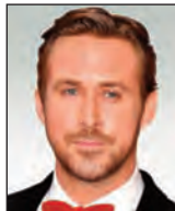
Ryan Gosling Theatre London, Ontario