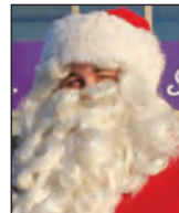
Santa Claus Supply Chain Mgmt The North Pole