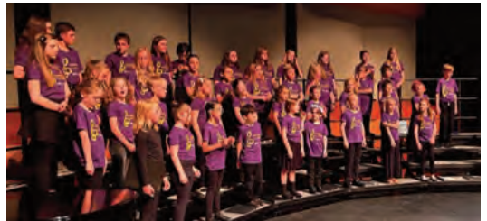
UNI Children's Chorus

The move to the 1,550-seat Gallagher-Bluedorn Performing Arts Center in 2000 only broadened the show’s appeal. To date, the Glee Club can boast more sold-out performances at the GBPAC than any other student or professional group.