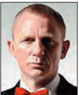
Daniel Craig Theatre/Acting London, England