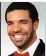
Drake Vocal Performance Toronto, Ontario