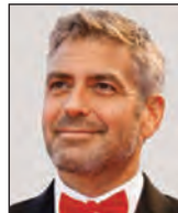
Bruce Wayne History & Poly Sci Gotham City, IA