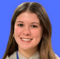
NORA MCAVAN FAMILY SERVICES AND PSYCHOLOGY DEWITT, IA