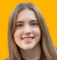
EMILI JOHNSON ELEMENTARY EDUCATION ELDRIDGE, IA