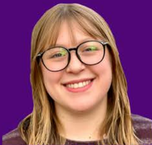
SHY BOWLING EARLY CHILDHOOD EDUCATION PRESTON, IA