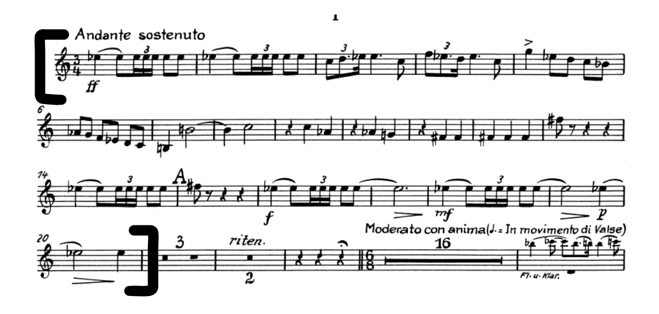
Tchaikovsky 4, opening to M.20 – Horn 4 in F

Tchaikovsky 4, mvt I opening to M.20 - Horn 1 in F