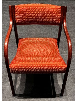
Red audience Chair

Retractable seats – Davis hall has a retractable seating system (bleachers) for audience/classroom seating. This is not frequently used.