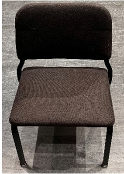
Black music Chair

Loose seats – Are seats that not connected permanently to the floor or cart. These can be for performers and audience.